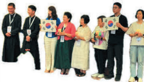
Below: South Koreans and then Cubans