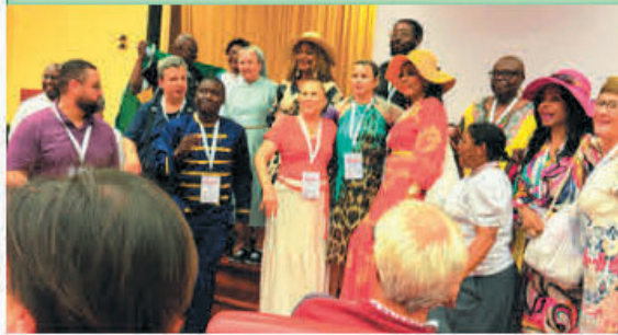
Above: Participants from Brazil and Cameroon