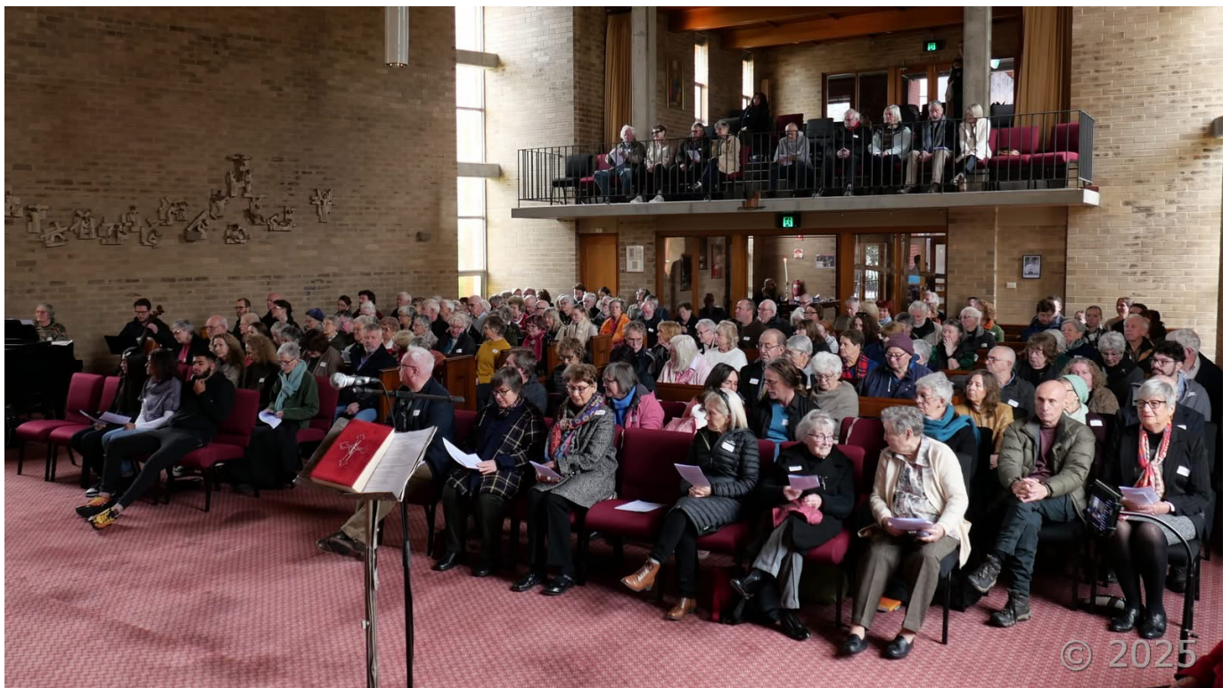
People gather in the Chapel.